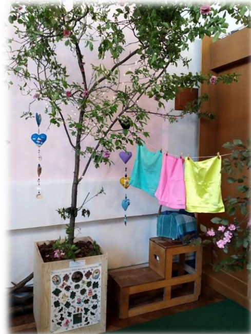
Morning has broken