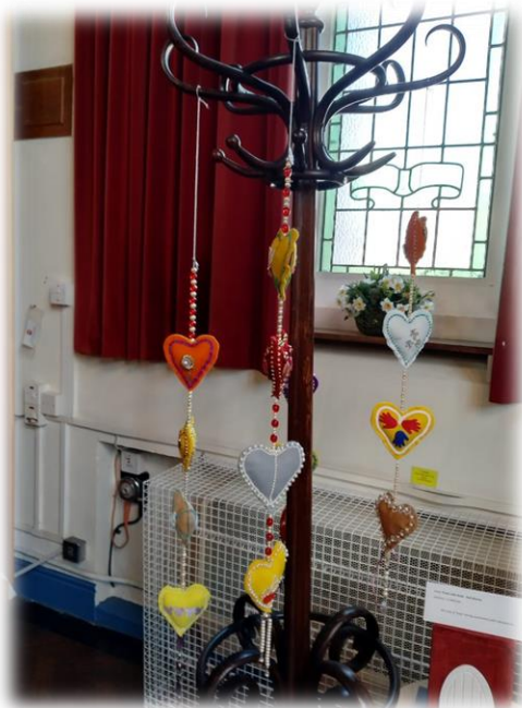
Love is in the air