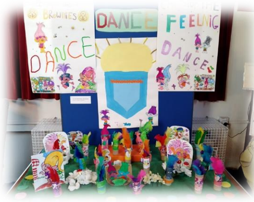
Can't stop the feeling