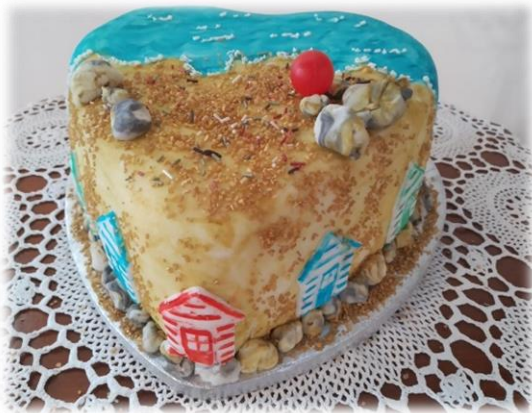
On the Beach

For our Church Anniversary members and groups of the church were invited to contribute items for an exhibition inspired by 'Songs of Love & Hope' (or songs that made you feel happy). As you will see from the photos below, there was a variety of inspired exhibits (unfortunately I can't show them all) that made up this Church Anniversary Exhibition. Each exhibit was based on a song which was played over the anniversary weekend so we could listen and watch. The Church was then open on the Saturday morning to allow people to visit, view and listen whilst enjoying some refreshments.