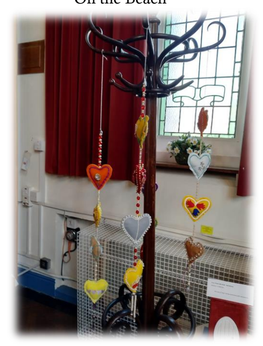
Love is in the air