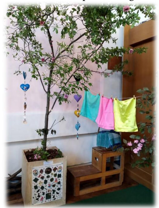
Morning has broken