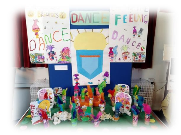
Can't stop the feeling