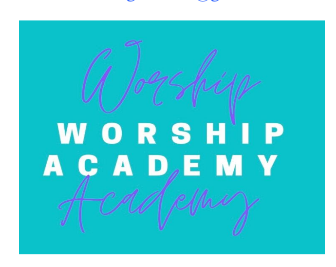
Book via Eventbrite

If you are interested in joining the mailing list for an invite please contact: southendandleighcircuit@gmail.com