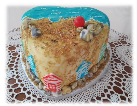
On the Beach

For our Church Anniversary members and groups of the church were invited to contribute items for an exhibition inspired by 'Songs of Love & Hope' (or songs that made you feel happy). As you will see from the photos below, there was a variety of inspired exhibits (unfortunately I can't show them all) that made up this Church Anniversary Exhibition. Each exhibit was based on a song which was played over the anniversary weekend so we could listen and watch. The Church was then open on the Saturday morning to allow people to visit, view and listen whilst enjoying some refreshments.